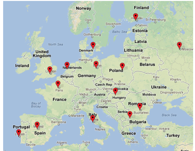
Figure 2: Demo screenshot: this geographical interface to voices can be found at http://tundra.simple4all.org/demo .

Static and interactive demos of the resulting voices are available at http://tundra.simple4all.org/demo . A screen shot of the geographically-organised demo page is shown in Figure 2.